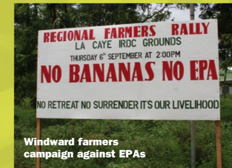
Windward farmers campaign against EPAs

Conrad perhaps best expresses the determination of farmers to recover their livelihood and their need for our continued commitment. "I have a lot of work on my shoulders but I will keep growing bananas. I will build this up again. Just please keep buying Fairtrade bananas."