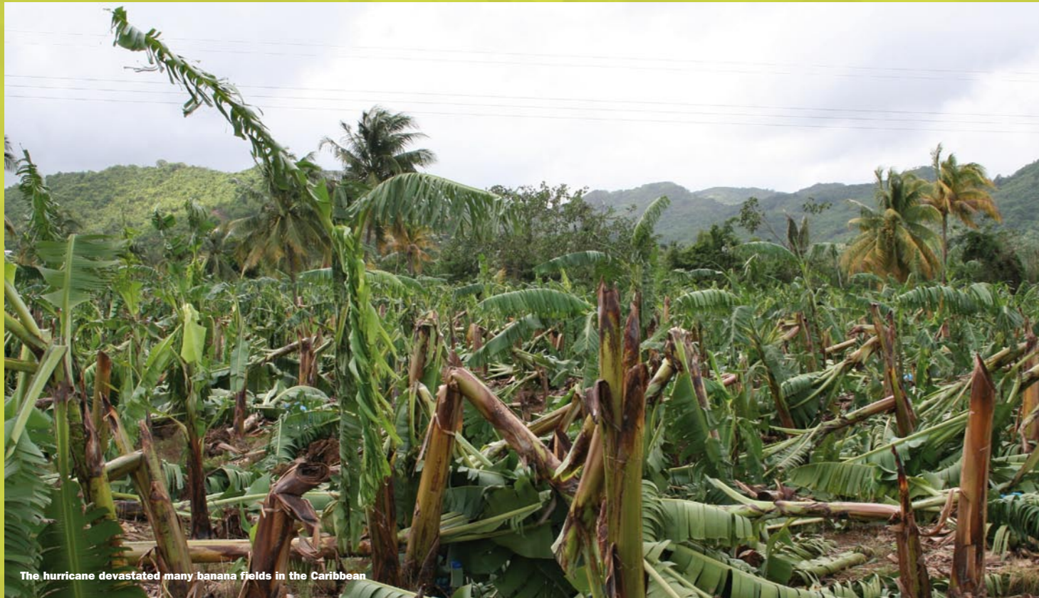
The hurricane devastated many banana fields in the Caribbean