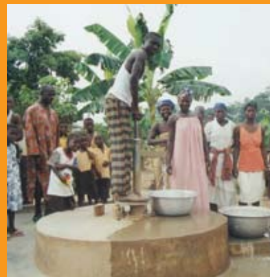
Members of Kuapa Kokoo and their new well