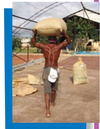
Sacks of Fairtrade cocoa ready for shipping (Dominican Republic)

The Global Gateway at www.globalgateway.org where schools can find information on the international dimension in education including international programmes for schools, funding opportunities, special partnership projects, online international school networks, and linking. It lists useful contacts for schools seeking to develop their international work nationally and by region.