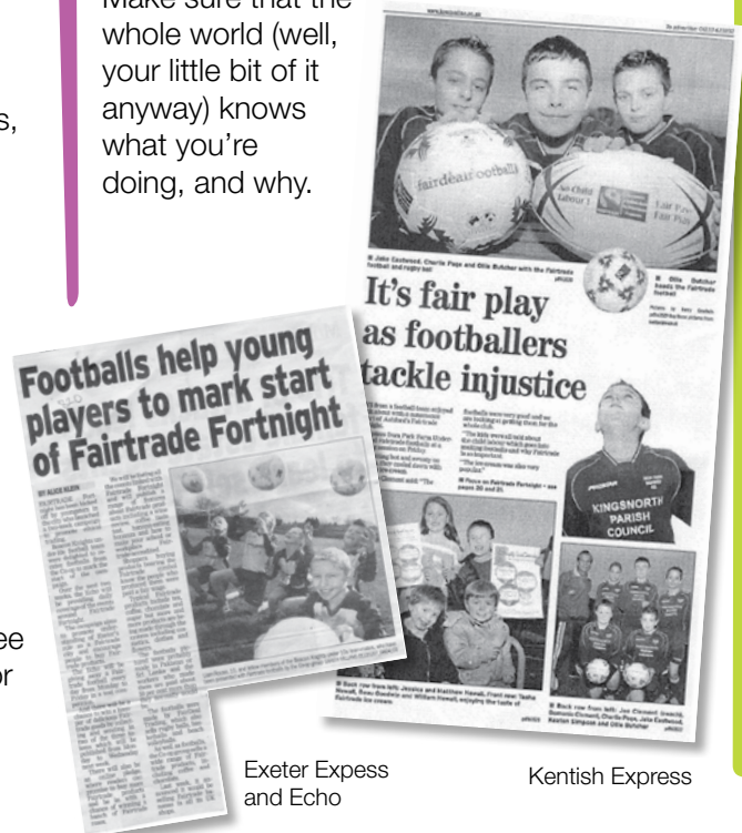
Exeter Express and Echo

Make sure that the whole world (well, your little bit of it anyway) knows what you're doing, and why.