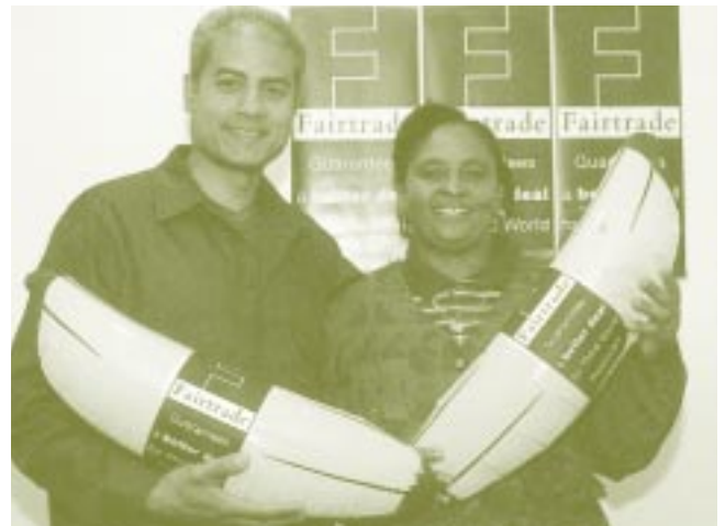
George Alagiah PATRON

Taking on global dysfunction is a daunting prospect. The wonderful thing about the concept of Fairtrade is that it allows all of us to make an impact doing what we would do anyway – buying coffee, chocolates, bananas and any of the other products that carry the Fairtrade Mark. True, these products cost more – but not nearly as much as the cost of doing nothing.