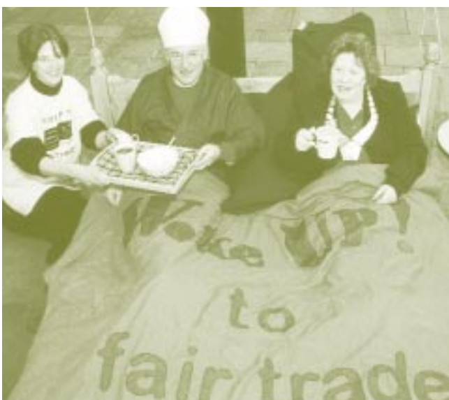
The Bishop of Salisbury having breakfast in bed in the town centre – winner of a 'Fairy' award.

Star turns, which earned the workaholic organisers the much coveted Foundation's 'Fairy' awards, included Oxfam Northern Ireland who worked with Larne and North Down Councils on Fairtrade policies and the National Assembly which agreed a Fairtrade purchasing policy.