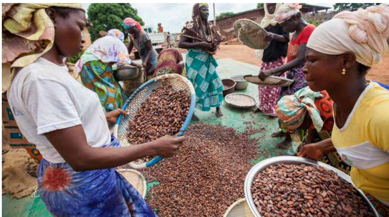
Sorting cocoa beans, Côte d'Ivoire

This publication is for information only, and we hope you will find it useful. All data in this document is publicly available information, and is assumed to be correct at time of issue. However, the Fairtrade Foundation accepts no responsibility or liability for any errors or omissions in the content of this document. The information is provided "as is" basis with no guarantees of completeness, accuracy, usefulness or timeliness.