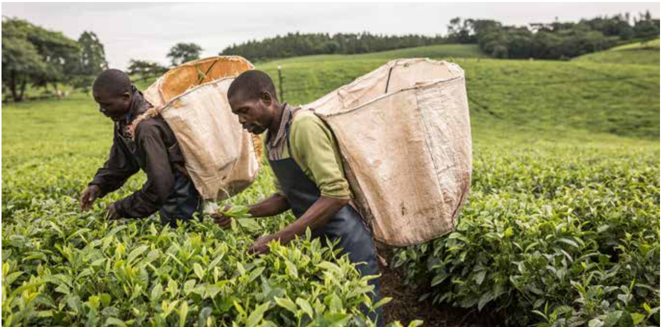
Workers picking tea leaves at the Satemwa tea and coffee estate, Malawi