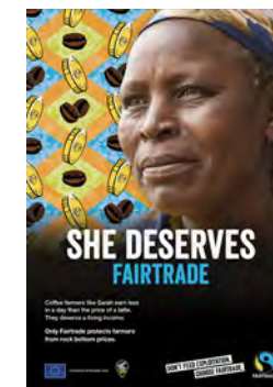
She Deserves Fairtrade campaign posters Refreshed for 2020