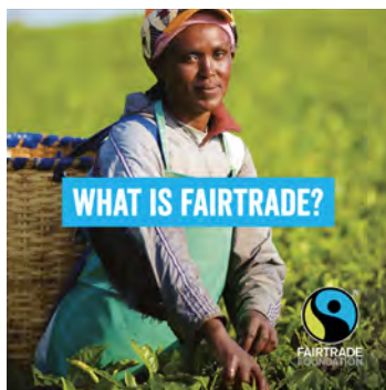
'What is Fairtrade?' leaflets