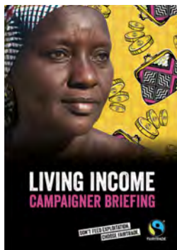
Living Income Campaigner Briefing Refresh yourself on the issues in cocoa in West Africa with our comprehensive campaigner briefing