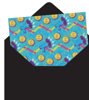
NEW storybombing kits Get storybombing the UK!