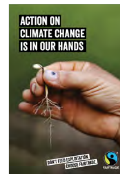
NEW recruitment postcards with a focus on Fairtrade and climate change. To use at climate focused events or to encourage people concerned about climate change to support Fairtrade