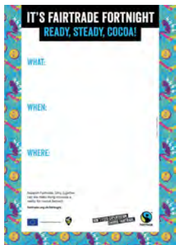
Event posters Advertise your events!

Available to order now at shop.fairtrade.org.uk to help you plan your events: