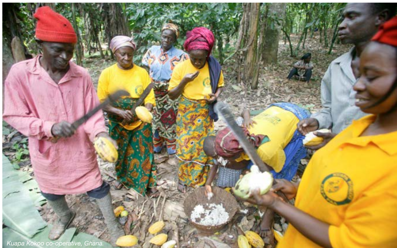
Kuapa Kokoo co-operative, Ghana.

A SYSTEMATIC APPROACH NEEDS TO BE TAKEN BASED ON ANALYSIS OF THE REASONS WHY WOMEN DON'T PARTICIPATE AS MUCH AS MEN