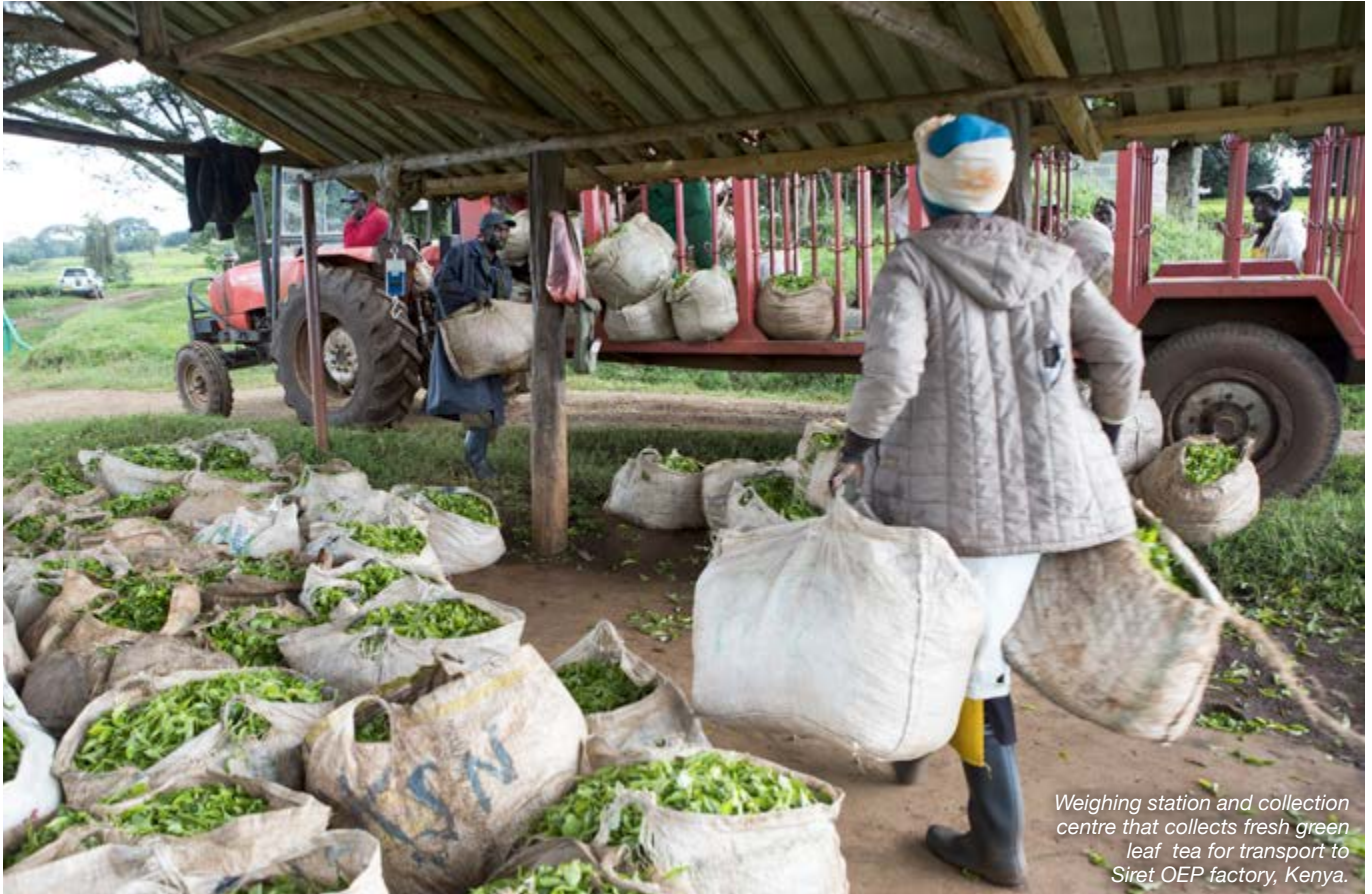
Weighing station and collection centre that collects fresh green leaf tea for transport to Siret OEP factory, Kenya.

Participants in the case studies identified a range of positive outcomes which they felt would result from enabling women to engage actively in SPOs. These include practical benefits such as increased productivity of farms and a source of income for single mothers, and more strategic gains such as greater economic independence, rights and influence for women, plus improved leadership and governance of producer organisations. But they also recognised the risks, which include adding to women's workload and creating tension by challenging sociocultural norms.