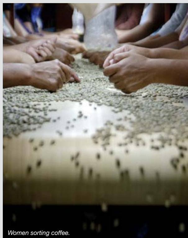
Women sorting coffee.

10. Explore how to alleviate the burden of other work to facilitate women's participation and inclusion (for example through a Gender Committee) and allocate a share of the Fairtrade Premium to be used according to women's priorities. Examples include: support to develop new income generating activities; literacy and numeracy training; loans to buy land; investment in labour saving technology (including community infrastructure); and investment in childcare facilities.